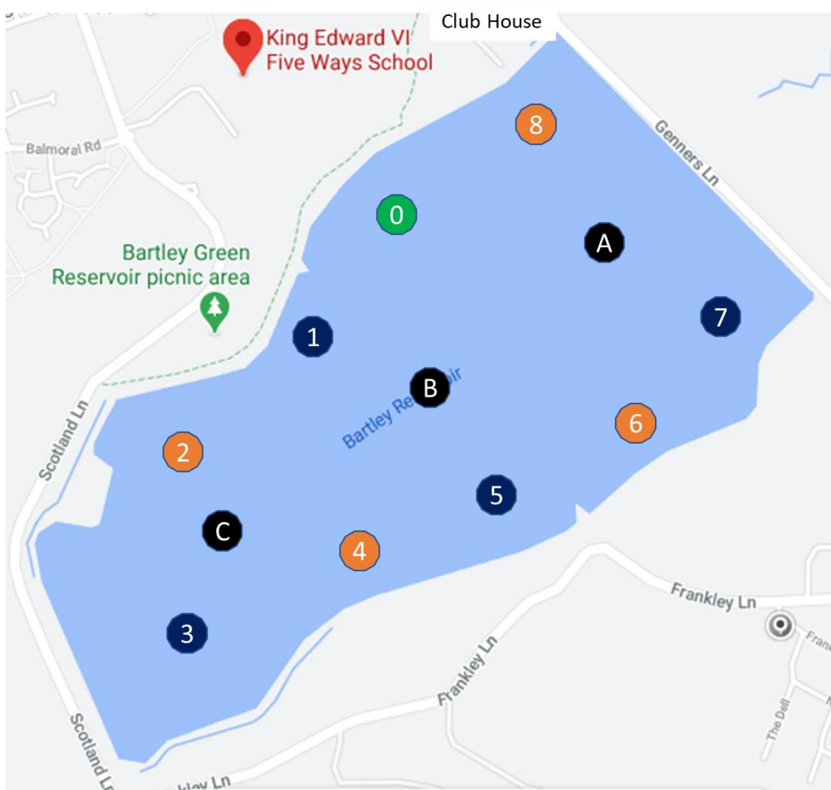
Diagram of Mark positions / colours for competitors