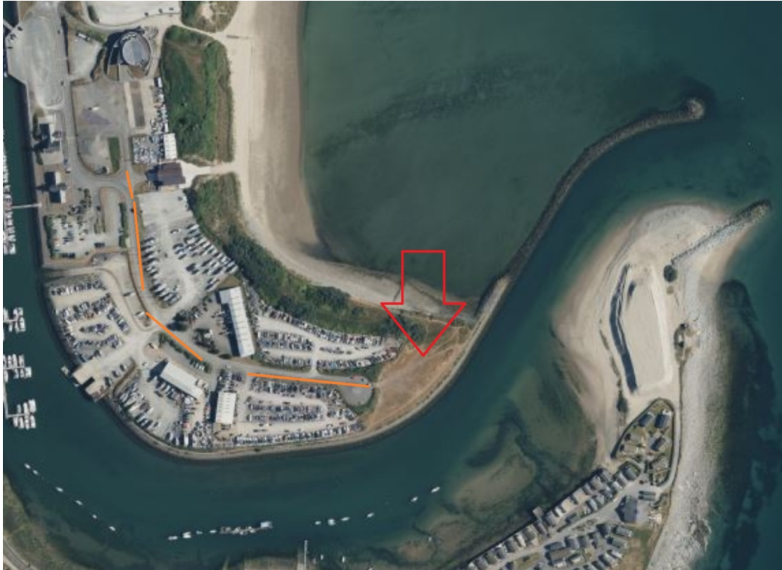
Large Events Trailer Park - Watch out for the Dolphin!!

All road trailers will be stored during the event at the end of the peninsula as shown above: