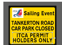
Signage for the event

Alternative car parking can be found in car parks such as the Gorrell Tank CP, 200 metres east of Whitstable Harbour. On-street parking in Whitstable and Tankerton is generally free of charge but may be some walking distance from either club.