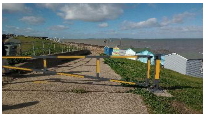
The approach to Tankerton Bay SC from Marine Crescent. Stewards will be present to assist.

For TBSC , on coming off the A299 for Whitstable most visitors take the Old Thanet Way / A2990 to the Chestfield and Swalecliffe roundabout, then 1 st exit under the railway bridge along Herne Bay road to the one way system. Go right around the one way system to take Marine Crescent for access the club. You can also access directions to TBSC by using this link. Location - Tankerton Bay Sailing Club (tbsc.co.uk)