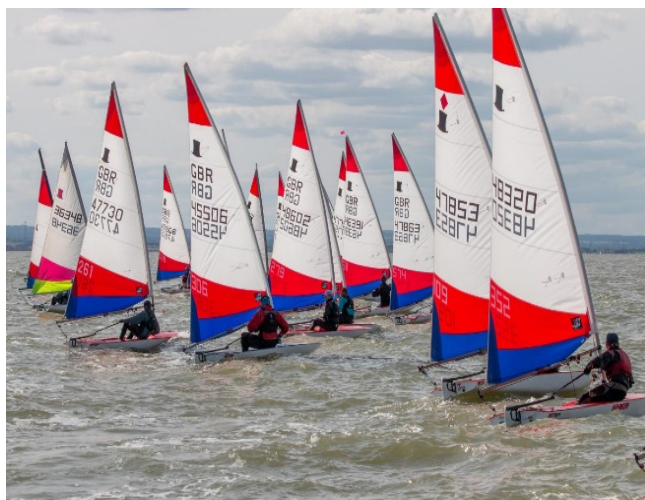
ITCA L&SE Racing at Whitstable Autumn 2022

On behalf of Whitstable Yacht Club and Tankerton Bay Sailing Club, we would like to extend a very warm welcome to all Topper Association sailors, families and friends - and to those who may soon be joining the Topper Association – for the National Series Race 4 Championship on May 20 th and 21 st 2023.