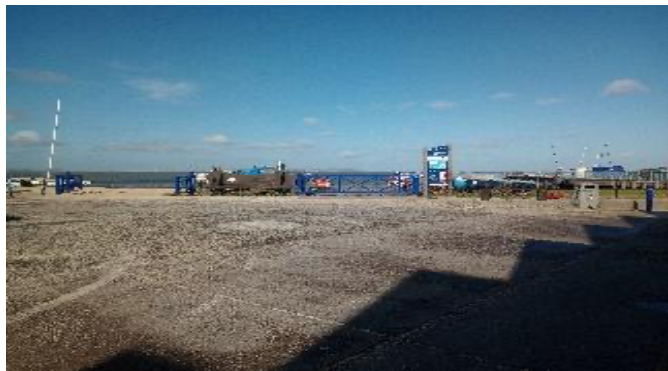
Whitstable harbour accessed from Harbour Street. Go through the small harbour CP. The drop off area shown here is adjacent to the RNLI station with the beach and sea beyond. Stewards will be present to assist.

For WYC , most visitors follow the brown signs for the harbour through the town, but do not use the WYC postal address with Sat nav for directions . It will take you to a dead-end of Sea Wall, the narrow lane that the club is on. Use the entry to Whitstable Harbour on Harbour Street for access to the boat dropping off area. The club is 30 metres away. You can also access directions on the WYC website by this link: Whitstable Yacht Club - Contact - FindWYC